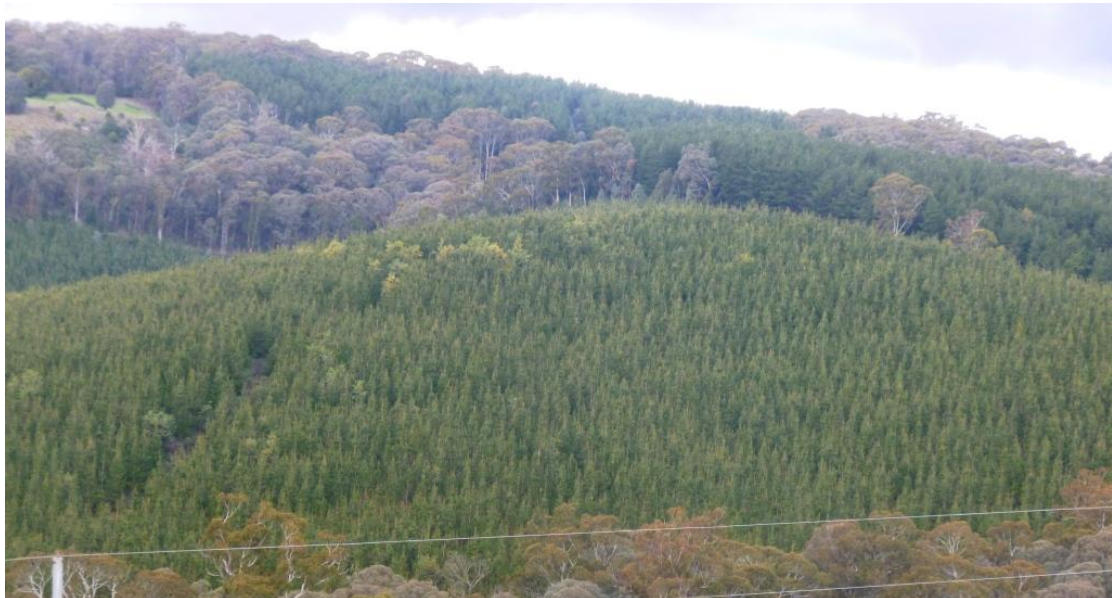
Figure 1: Hansen 2007 AC – (July 2014).

There are some localised areas where very heavy blackberry competition, has resulted in some small unstocked areas, mostly located adjacent to drainage lines and gullies.