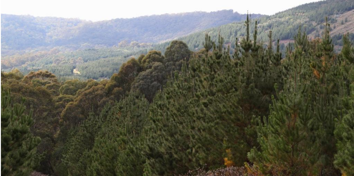
Figure 2: The Valley (2005 Age Class) – well stocked & good growth

The seedlings planted in 2012, in the area burnt by wildfire in 2010, have generally established successfully, excluding localised areas where there is significant surface rock. No additional treatments are recommended for this area.