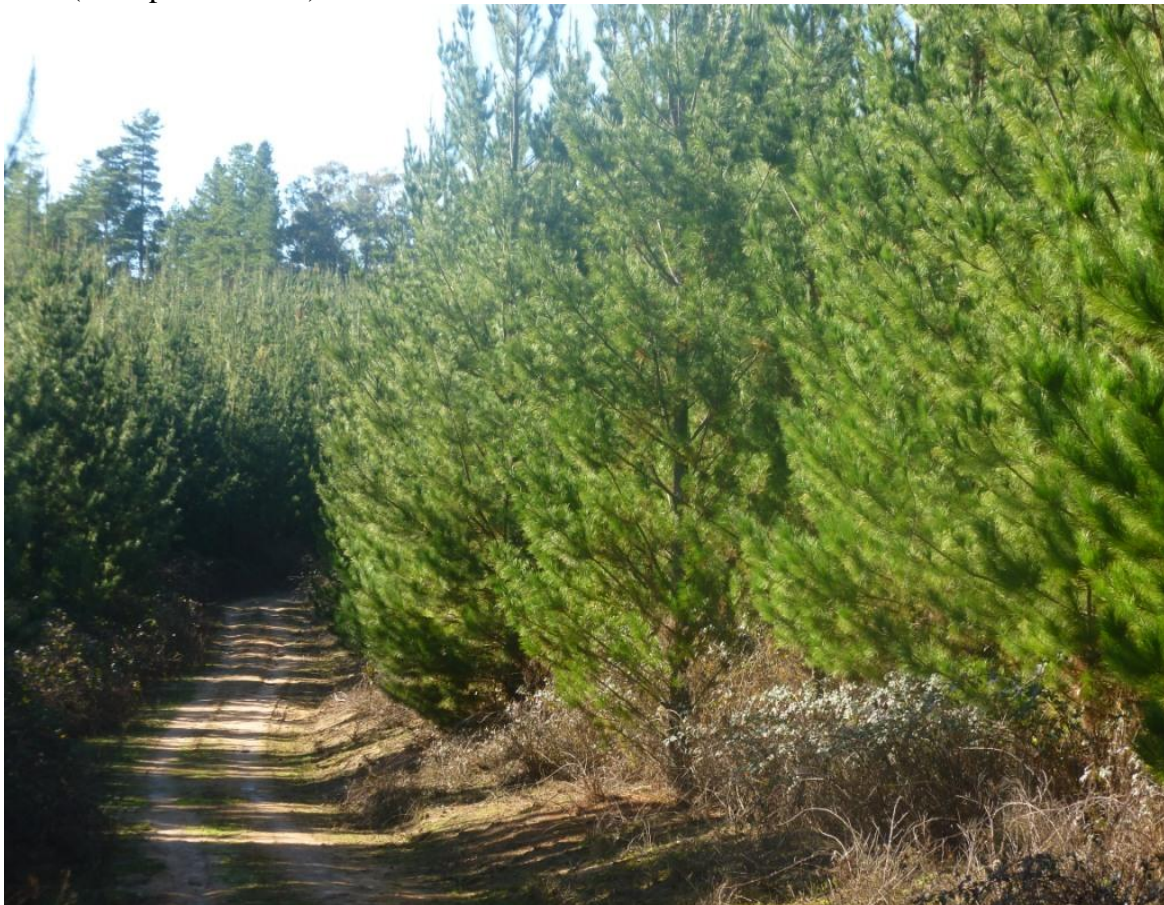
Figure 1: Dr Vance (2005 Age Class) July 2014 – good growth and healthy trees

The Dr Vance plantation continues to perform well, with trees displaying superior growth and form (refer photo below).