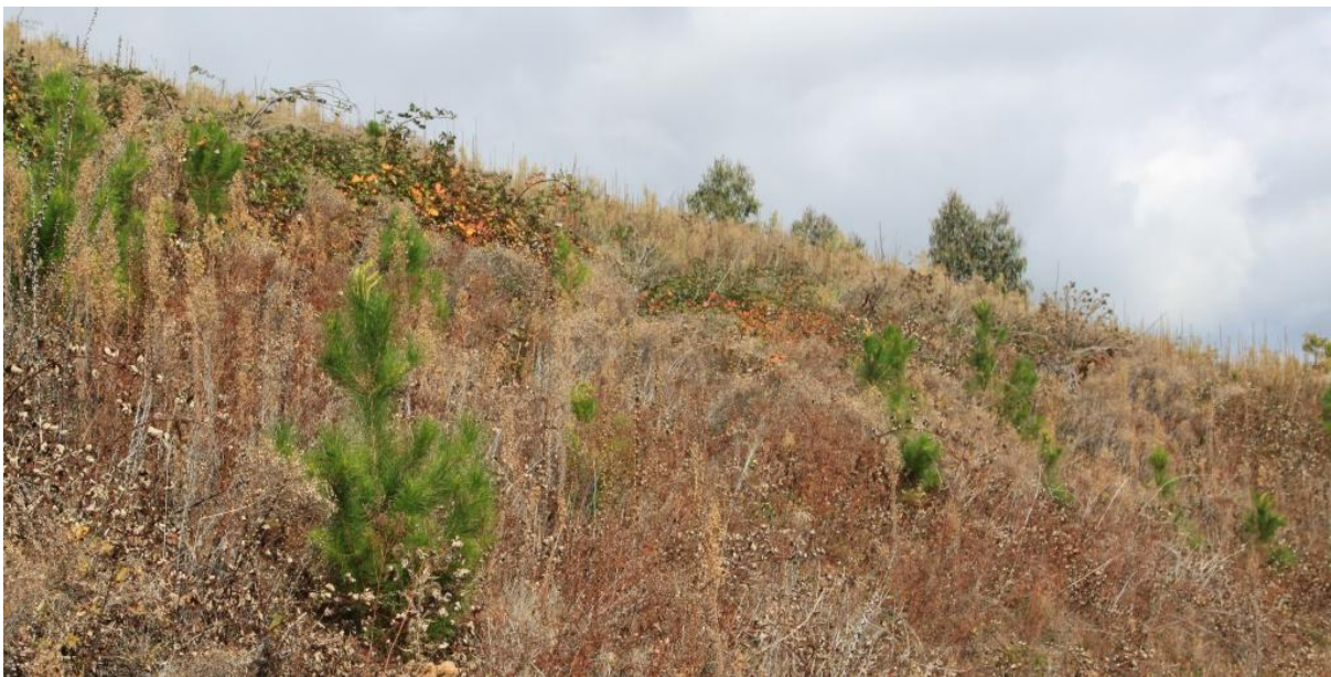
Figure 3: The Valley 2012 seedlings planted in 2010 fire area