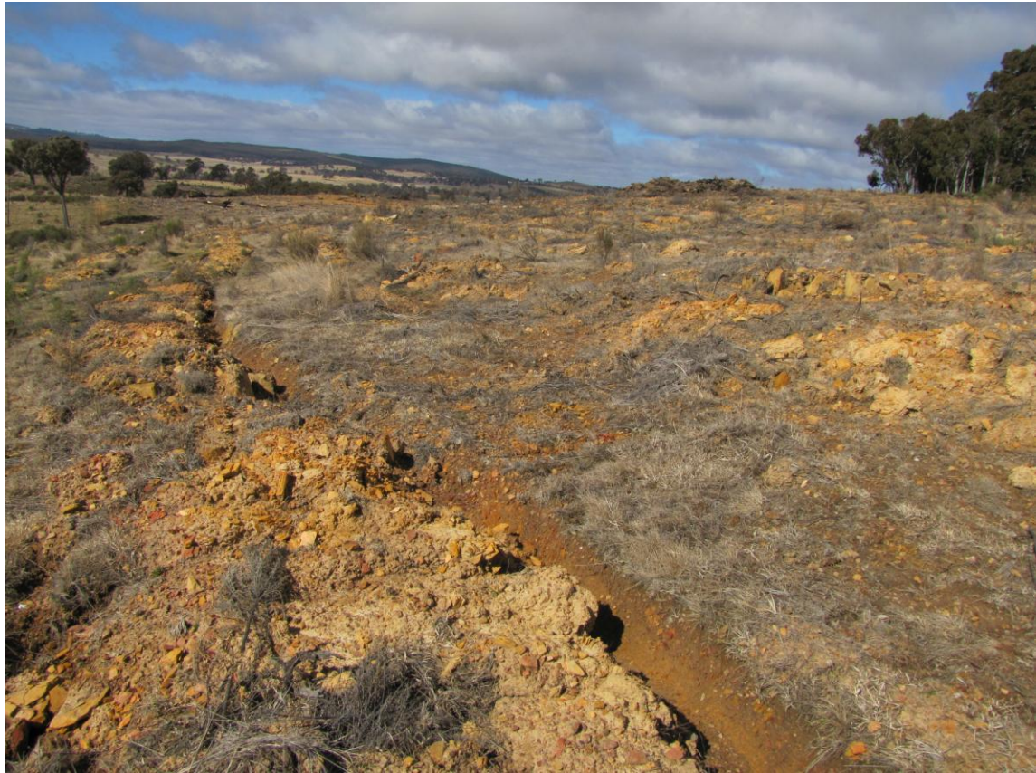
Wandalla Stage 4 – ripped and mounded site