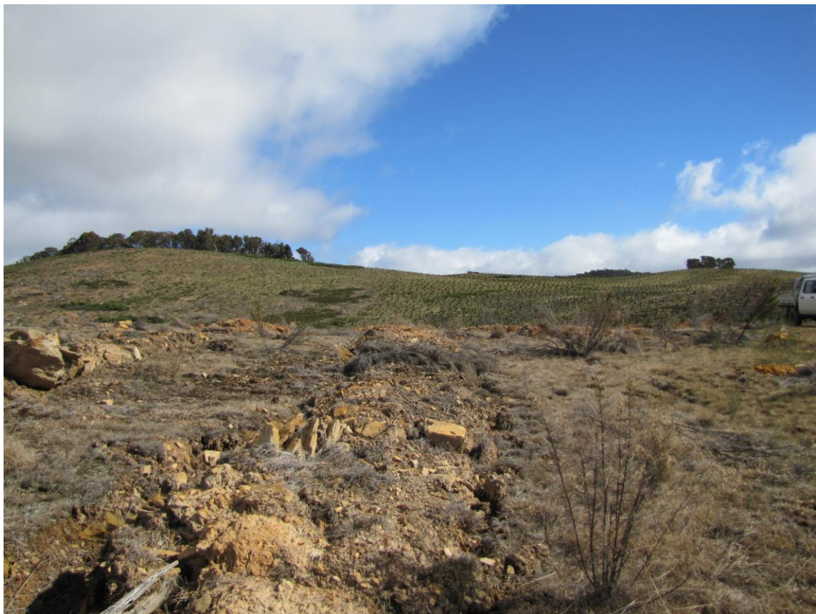
Wandalla Stage 4 looking north-west over Stage 3.