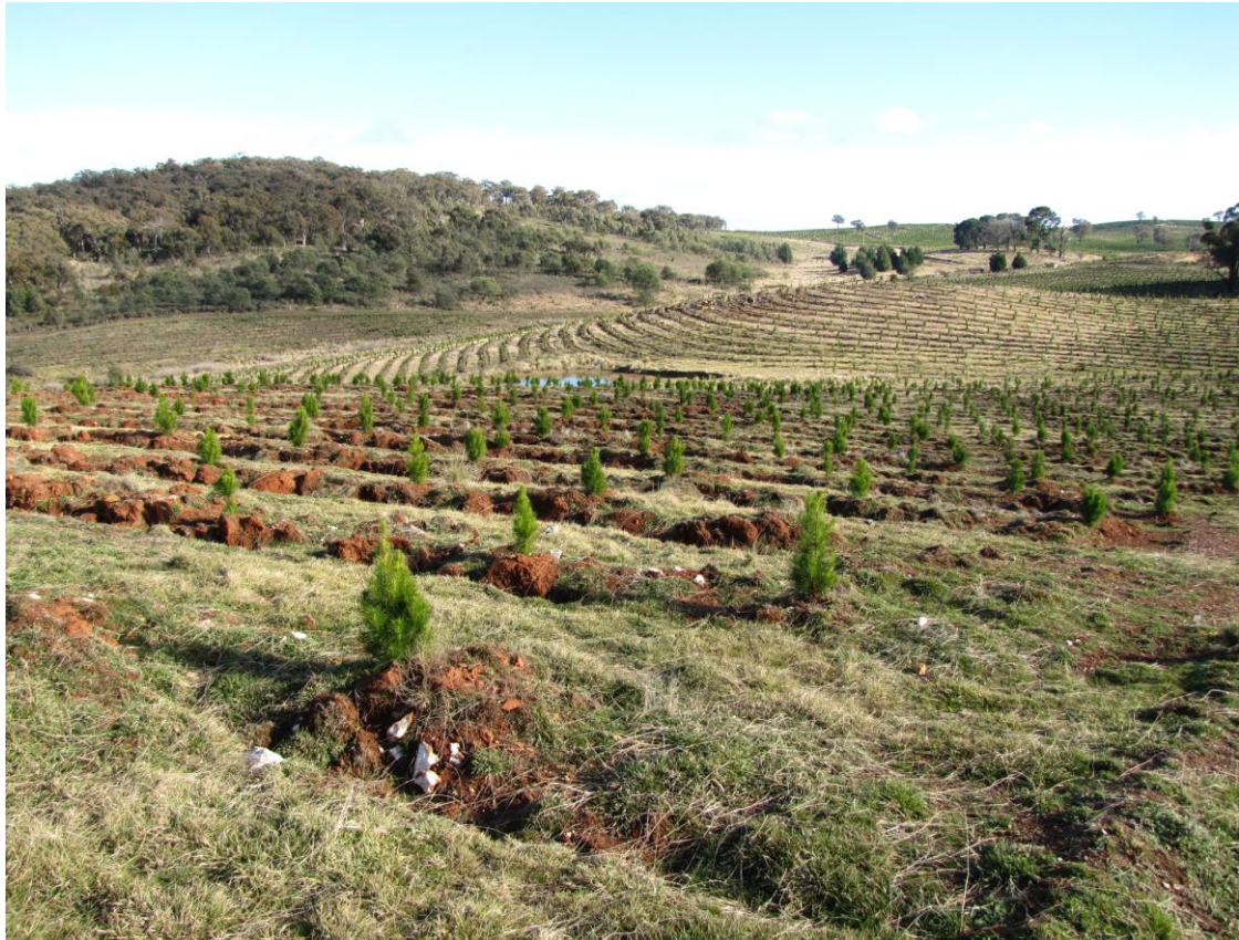
Wandalla Stage 3 – excellent survival on ripped and mounded site