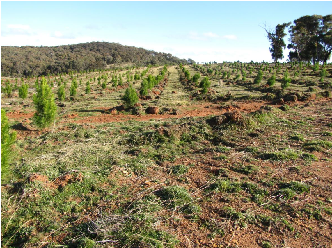
Wandalla Stage 3