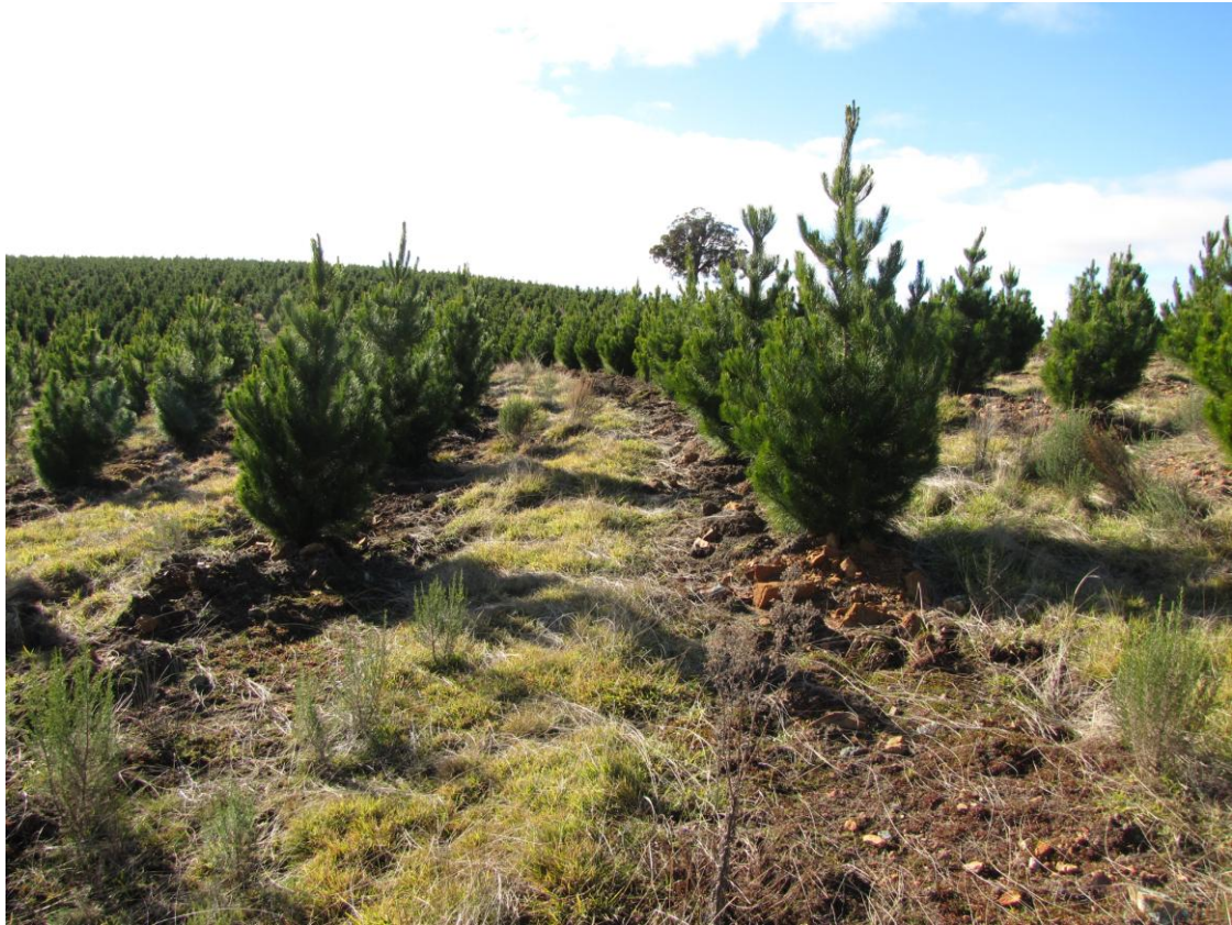
Wandalla Stage 2 – 2 year old seedlings on ripped and mounded site (July 2012)