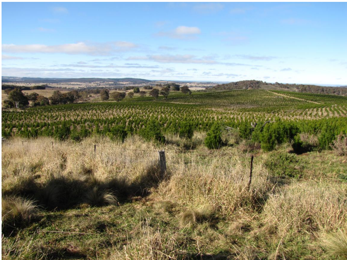
Stage 2 Wandalla (July 2012)