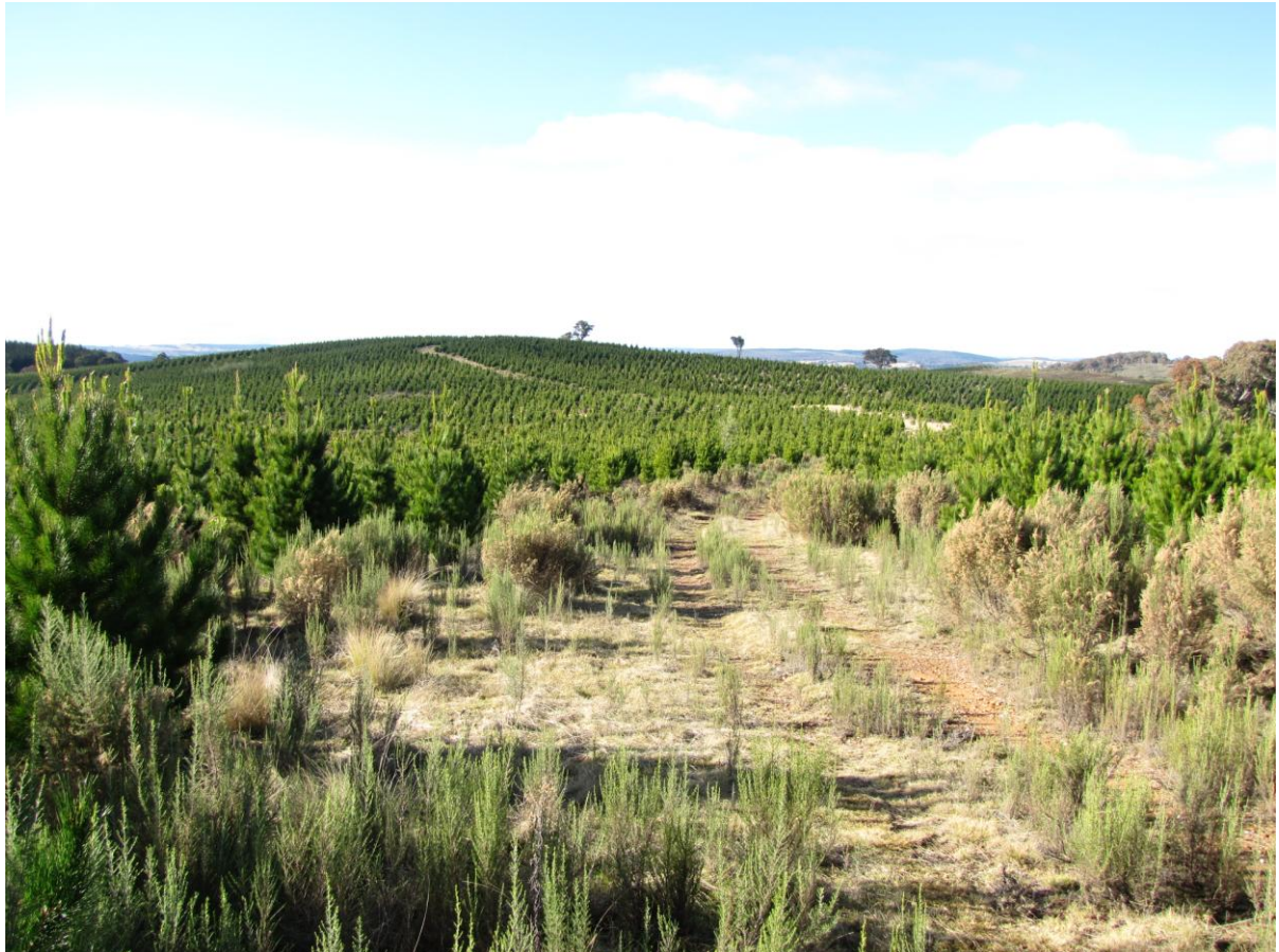
Wandalla 2009 age class showing excellent survival and form (July 2012)

Favourable growing conditions have supported good growth of seedlings. Survival levels remain excellent. A small area of the plantation is showing a potential deficiency in Magnesium/Potassium. Further investigations will be undertaken to verify the cause.