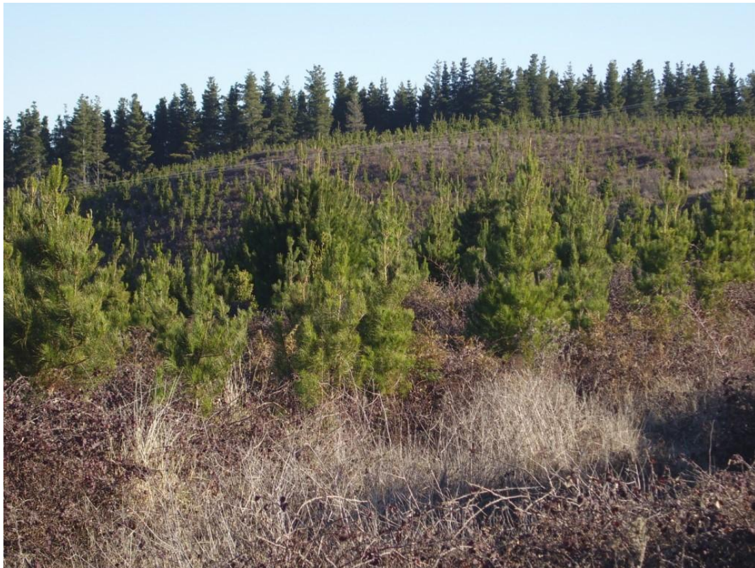
Turner 2009 age class July 12