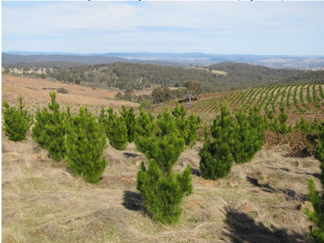
Photo 1. Wandalla 2009 age class showing excellent survival and form (August 2011)