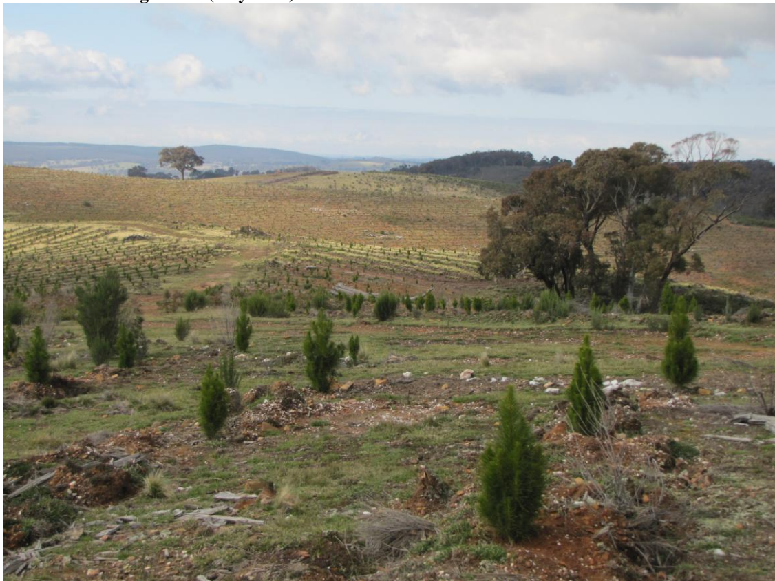
Wandalla 2009 Age Class (July 2010)

A Stage 1 inventory stocking assessment was conducted in March 2010. The assessment revealed an average stocking of 1,025 stems per hectare which equates to 91% survival.