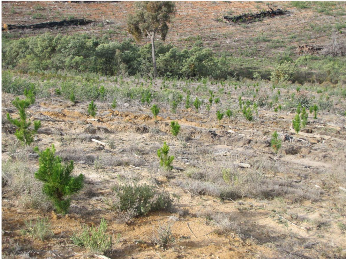
Figure 3: Wandalla Stage 4 – one year old trees on ripped and mounded site