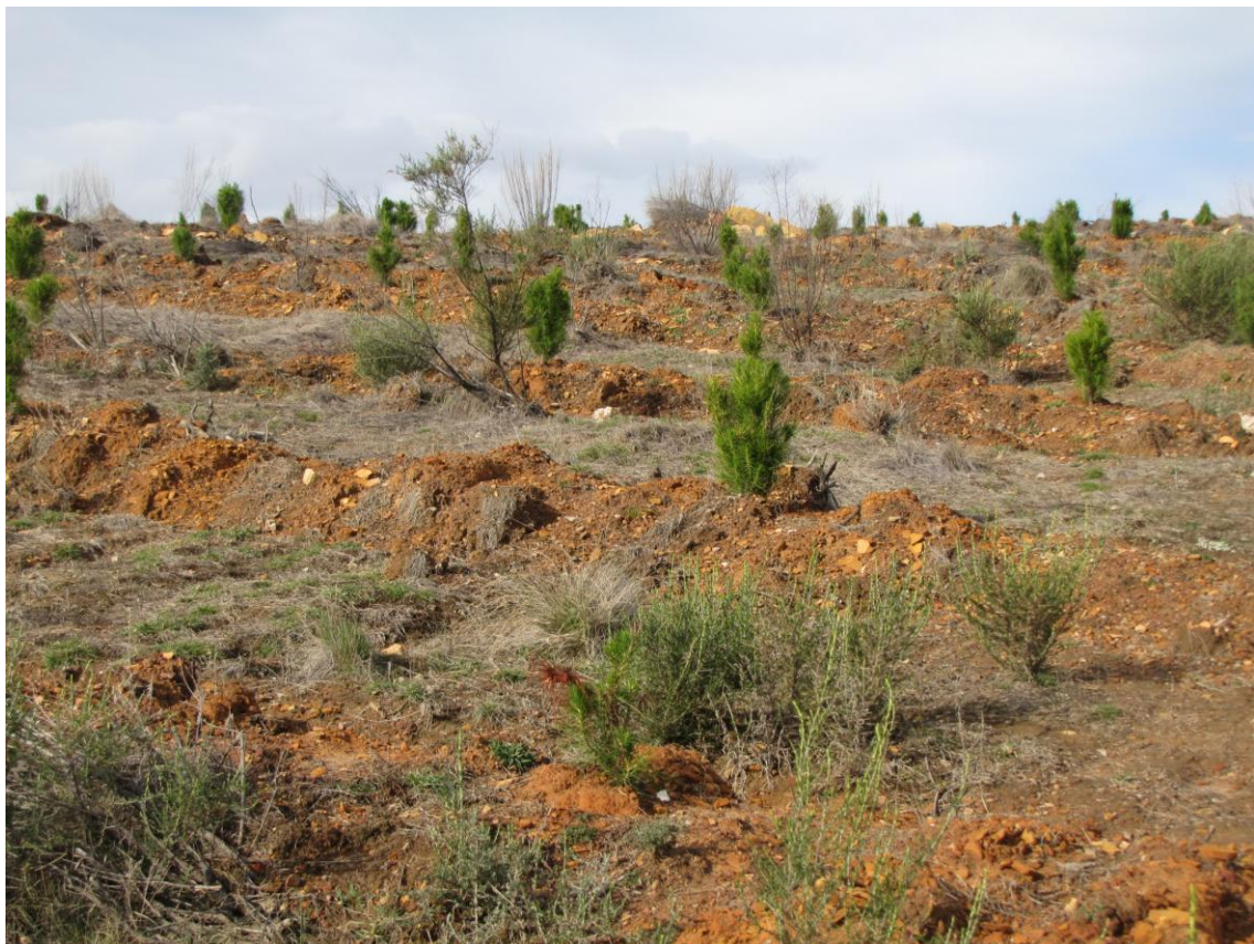
Figure 4: Wandalla Stage 4 – excellent weed control result and good early form.