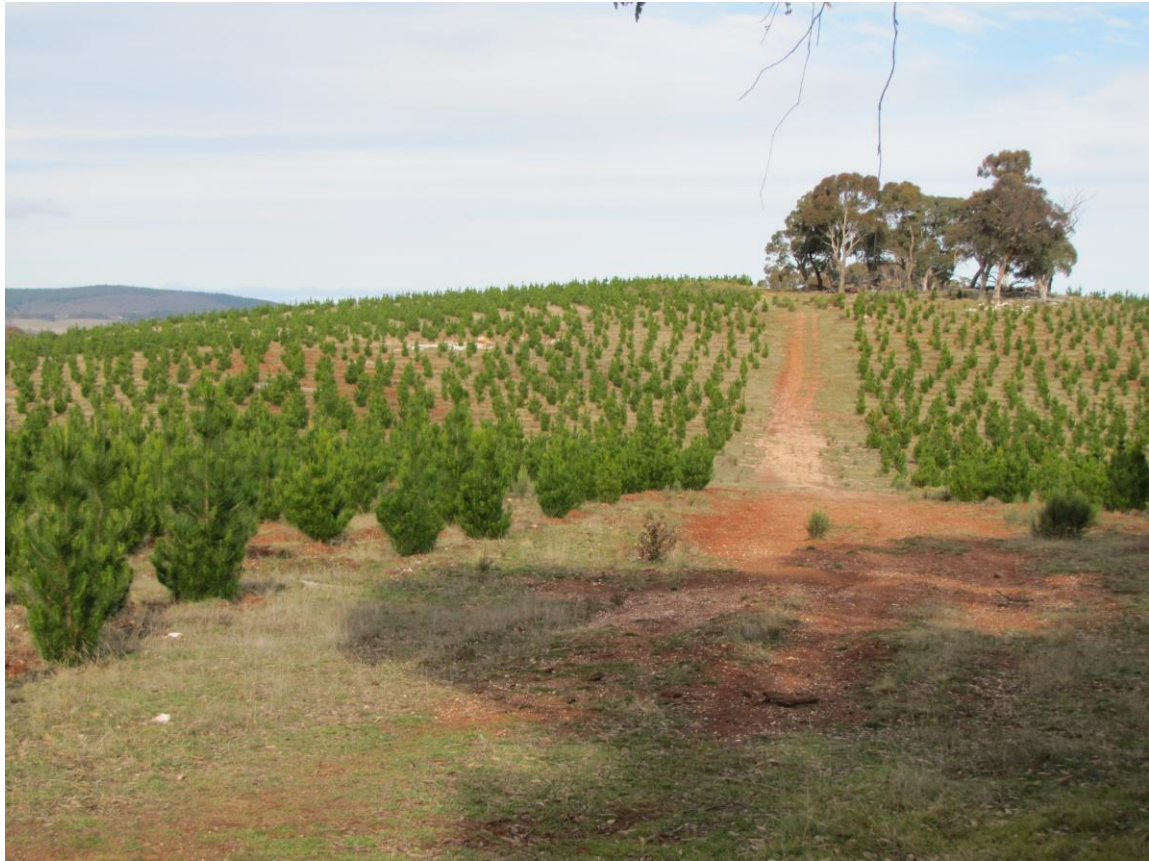
Figure 2: Wandalla Stage 3 – excellent survival and good early growth