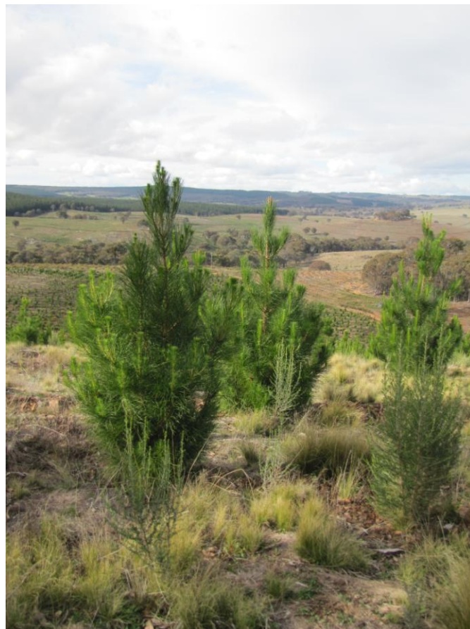
Figure 3: Wandalla Stage 3 – excellent form despite a difficult growing season