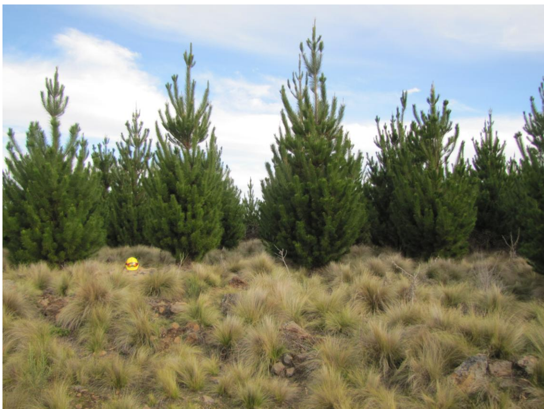
Figure 2: Wandalla 2009 age class showing excellent survival and form (June 2013)