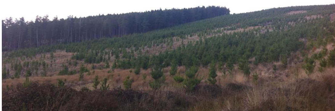
Figure 4: Steiner 2009 AC July 13 – patches of low stocking on wet soak areas within the plantation

Tree growth, stocking and condition is satisfactory, with trees continuing to grow well and stocking is generally good. On the Steiner block there is approximately 2 hectares of plantation with low or no stocking. Poor drainage is the cause of this issue (refer figure 3).