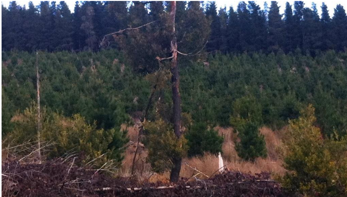
Figure 6: The Valley HQ – unstocked drainage depression in foreground.

The valley HQ plantation is generally growing well and has good stocking. A localised area associated with saturated soils in a drainage depression is not stocked. It is not considered feasible to restock this area due to the soil conditions.