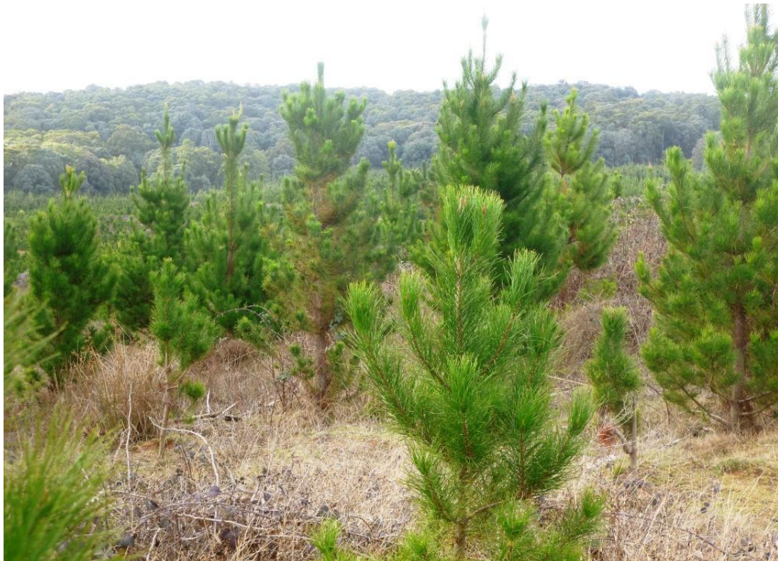
Figure 5: Hosking – August 2013 - Good tree growth

The Hosking plantation is growing well with good stocking and tree growth. Some small areas of animal damage have occurred on the plantation edges adjacent roads. Generally the trees are growing to sufficient size that ongoing damage will be minimal.