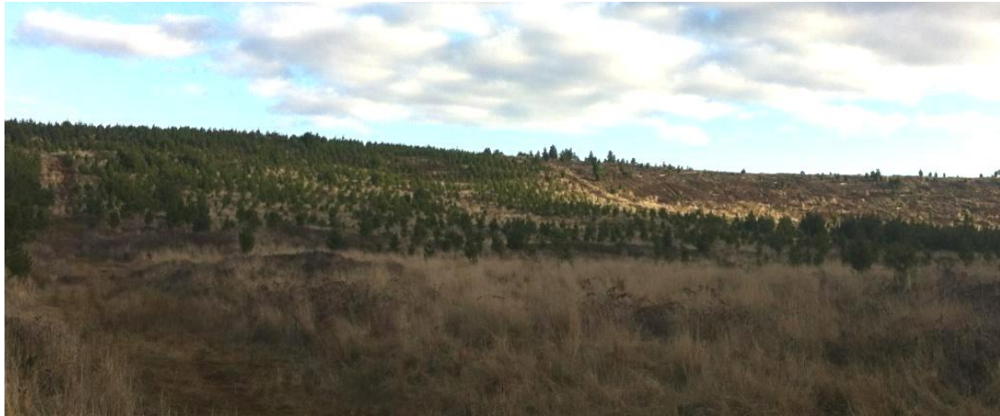
Figure 4: Turner 2009 age class July 13 – unstocked area on lower slope

The plantations in the Turner block have recovered well from the heavy hail storm that occurred in late 2011. Recent observation indicates that the trees are not suffering from any ongoing affects.