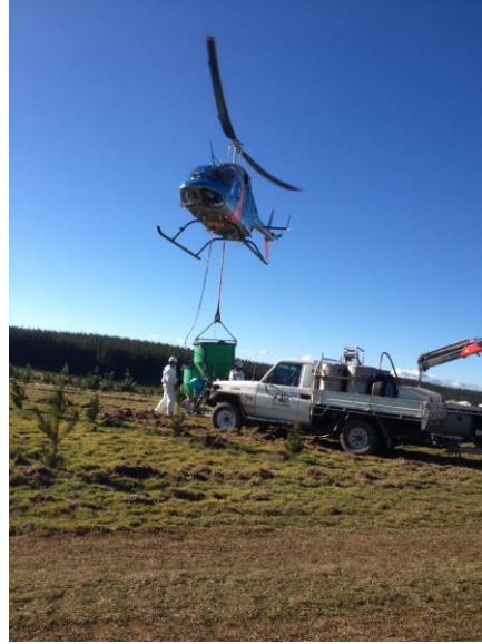
Application of boron at Press, April 2014