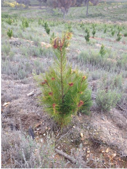
2 year old seedling exhibiting boron deficiency